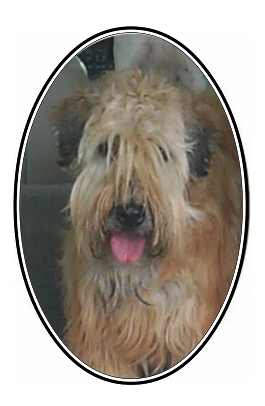
Willow Wheatndales Will O The Wisp February 12, 1993 - November 9, 2003

We have a secret, you and I that no one else shall know, for who but I can see you lie each night in fire glow? And who but I can reach my hand before we go to bed and feel the living warmth of you and touch your silken head? And only I walk woodland paths and see ahead of me, your small form racing with the wind so young again, and free. And only I can see you swim in every brook I pass and when I call, no one but I can see the bending grass.