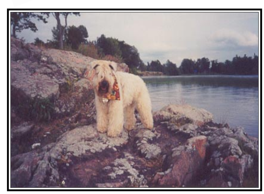
"Dogs are our link to paradise. They don't know evil or jealousy or discontent. To sit with a dog on a hillside on a glorious afternoon is to be back in Eden, where doing nothing was not boring—it was peace." - Milan Kundera

Place on greased baking sheet and bake for 20 minutes. Cool on rack and then seal in airtight container.