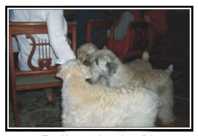
The ad hoc committee enjoys a little behind the scenes "graft"