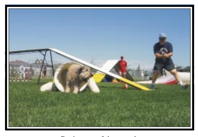
Racing out of the tunnel.