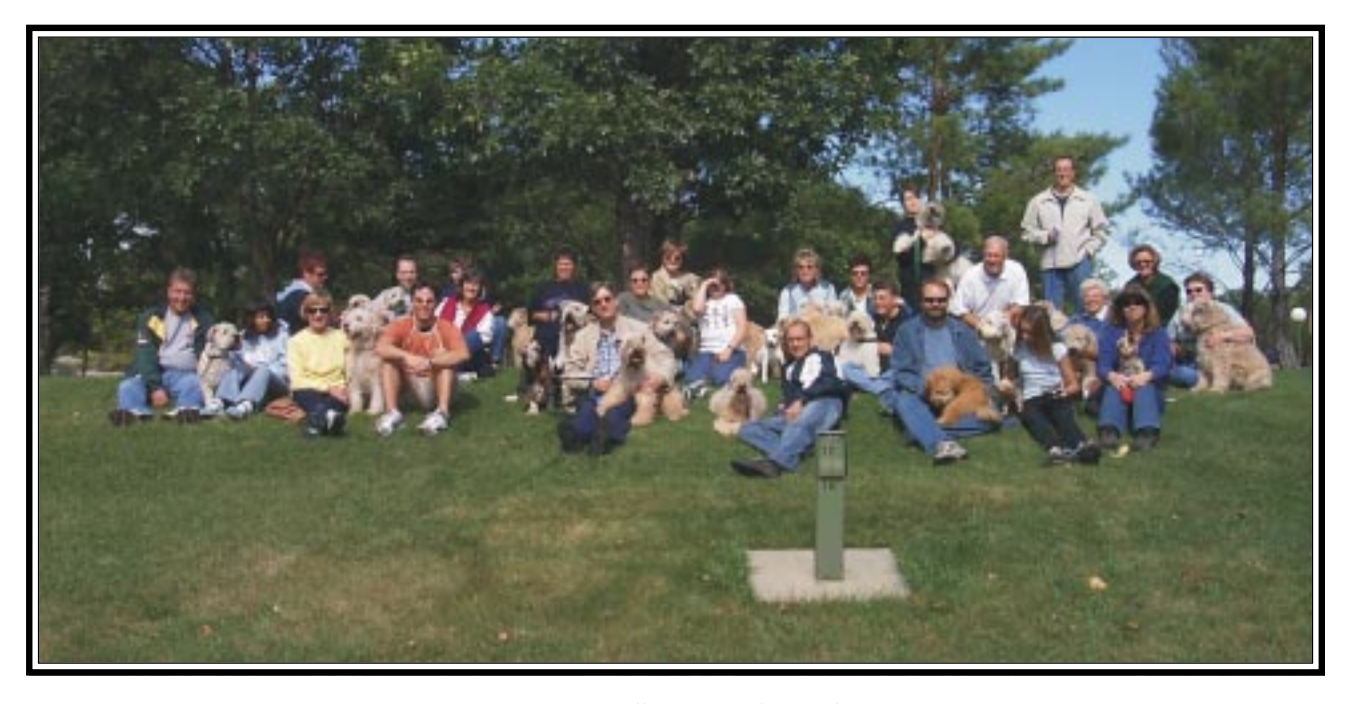
Autumn Walk - September 14th 29 people, 23 Wheatens, 4 others