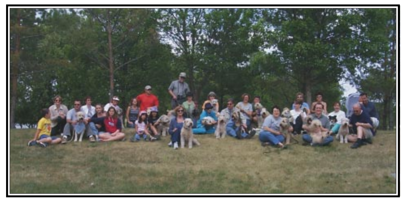
Spring Walk - June 1st 35 people, 20 Wheatens, 5 others