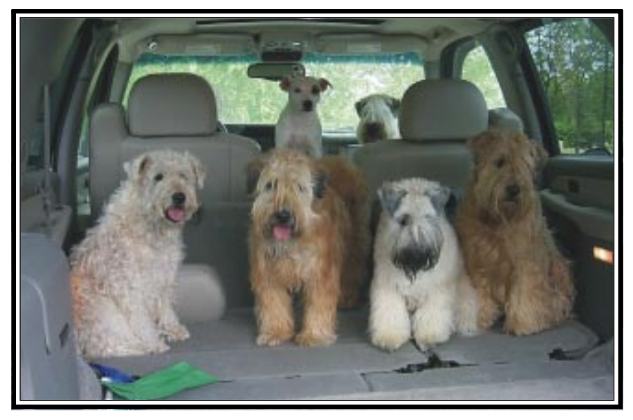
Overheard at the end of the Spring Wheaten Walk: "Roz, do we have to go home already?"

It was announced on September 26, 2003 that scientists have completed a first rough draft sequence of the genes of a dog. The study shows that dogs have 2.4 billion base pairs of DNA, roughly a half-billion less than humans. In a dog's DNA there are possibly 30,000 genes that canine cells use as templates to make proteins. These sophisticated molecules build and maintain the animal's body. It is probably no surprise to us that substantial numbers of canine genes are employed by the olfactory system - a dog's sense of smell. One realization discovered by the scientists is that 75% of the genes found in humans are also found in dogs. It appears that we have more in common with our canine friends than we thought. Sources: BBC News; Associated Press.